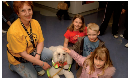
PAT Volunteer with children at the Open Day 2006.