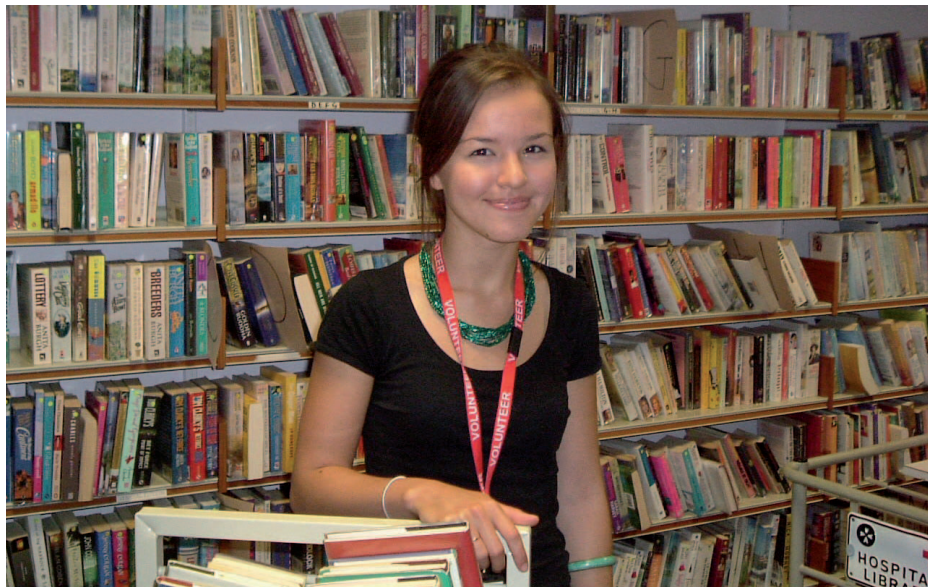
A volunteer with the library

Are you good at keeping kids amused? Then why not consider volunteering in Outpatients Play ? There are vacancies on a Monday