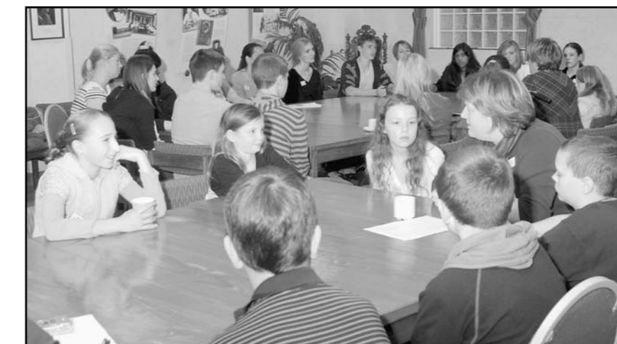
Children and young people talk about the type of issues the new board will discuss

We will keep you posted on the progress and work of this new board in future editions of Members Matter .